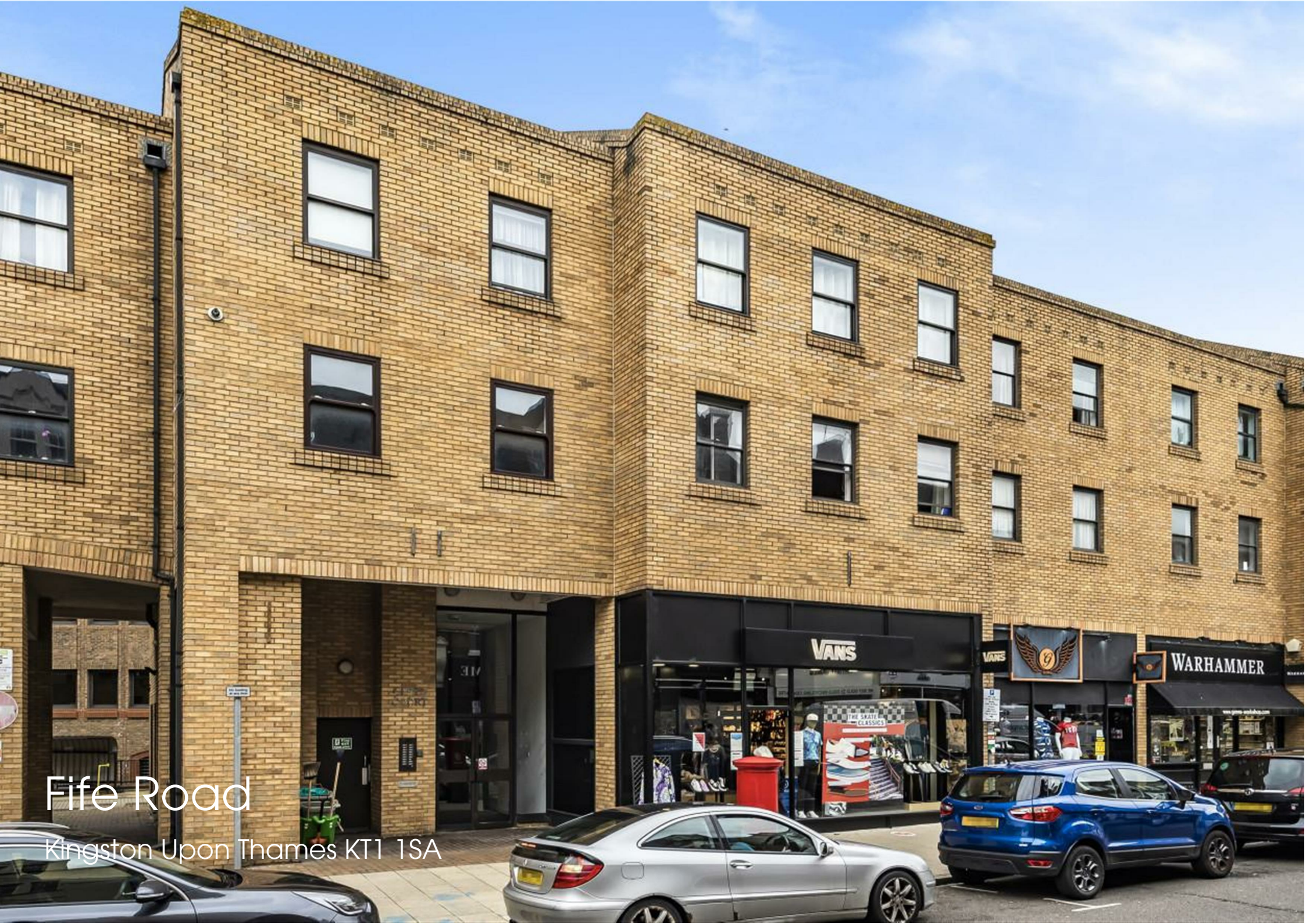
Fife Road Kingston upon Thames KT1 1SA